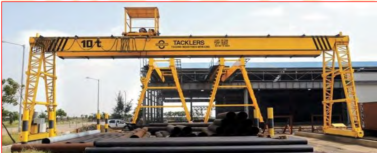
Double Girder Gantry Crane ⦿ Capacity : 10 Tons ⦿ Span : 18 Mtrs.