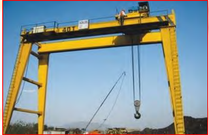
Goliath Crane Ⓡ Capacity : 40 Tons