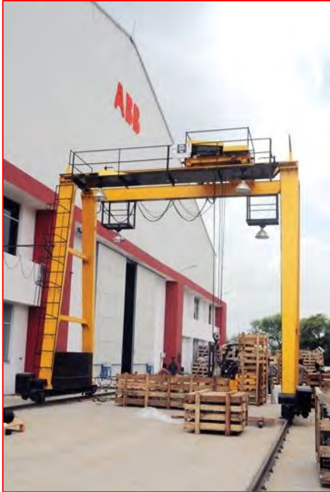
Gantry Crane Ⓡ Capacity : 5 Tons