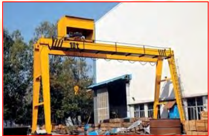
Gantry Crane Ⓡ Capacity : 10 Tons