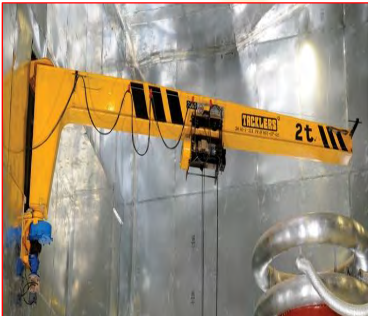
JIB Crane ☉ Capacity : 02 Tons ☉ Span : 06 Mtrs.