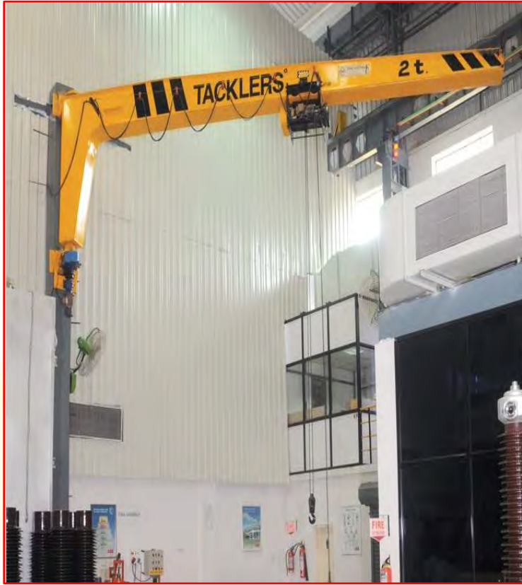
JIB Crane ☉ Capacity : 02 Tons ☉ Boom Length : 06 Mtrs.