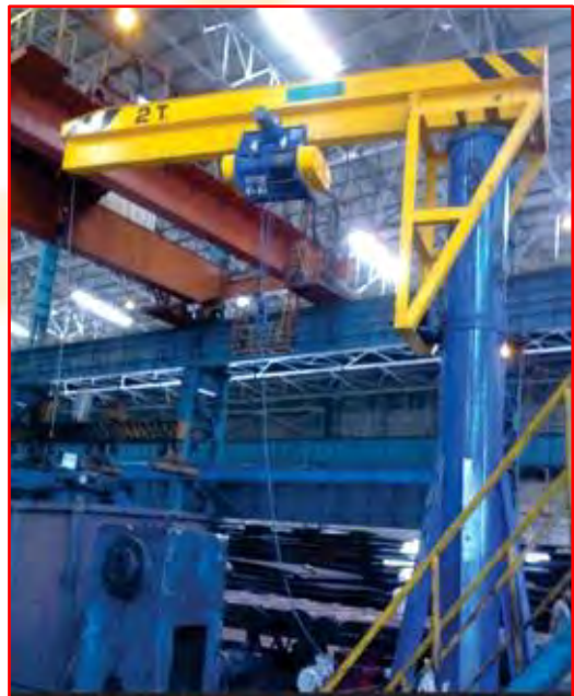
JIB Crane ☉ Capacity : 02 Tons