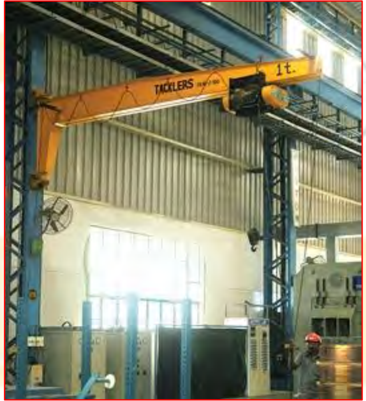
JIB Crane ☉ Capacity : 01 Tons